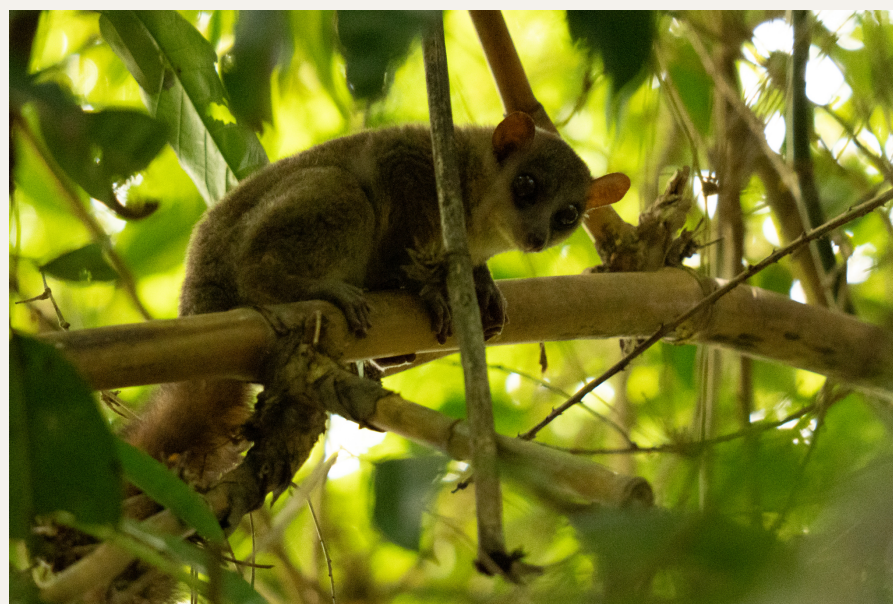
Mirza zaza · Northern giant mouse lemur