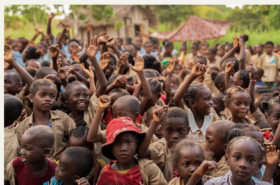
And later, a mosh pit.

“We are committed to remain at this site for as long as is necessary to ensure the protection of the forest.”