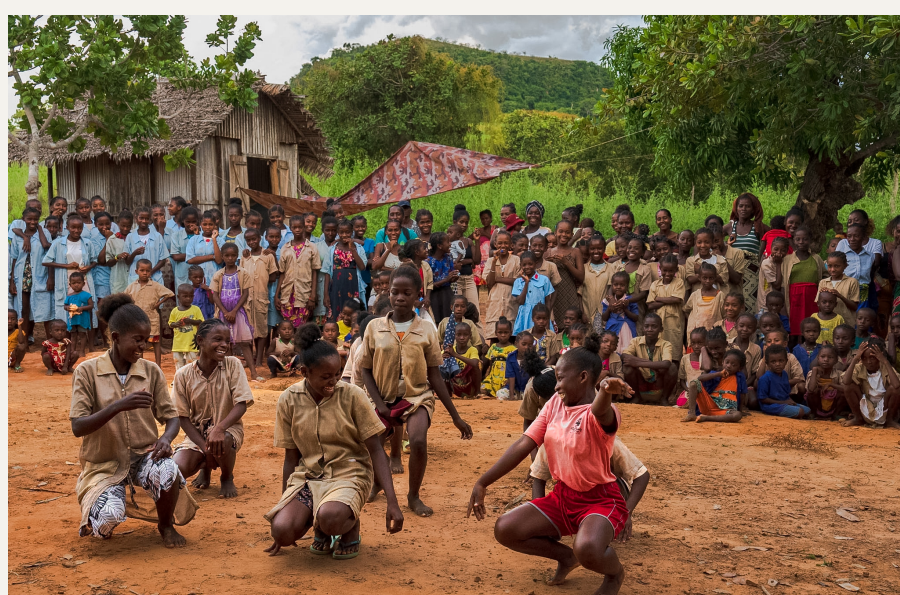
Girls dancing in the talent show.