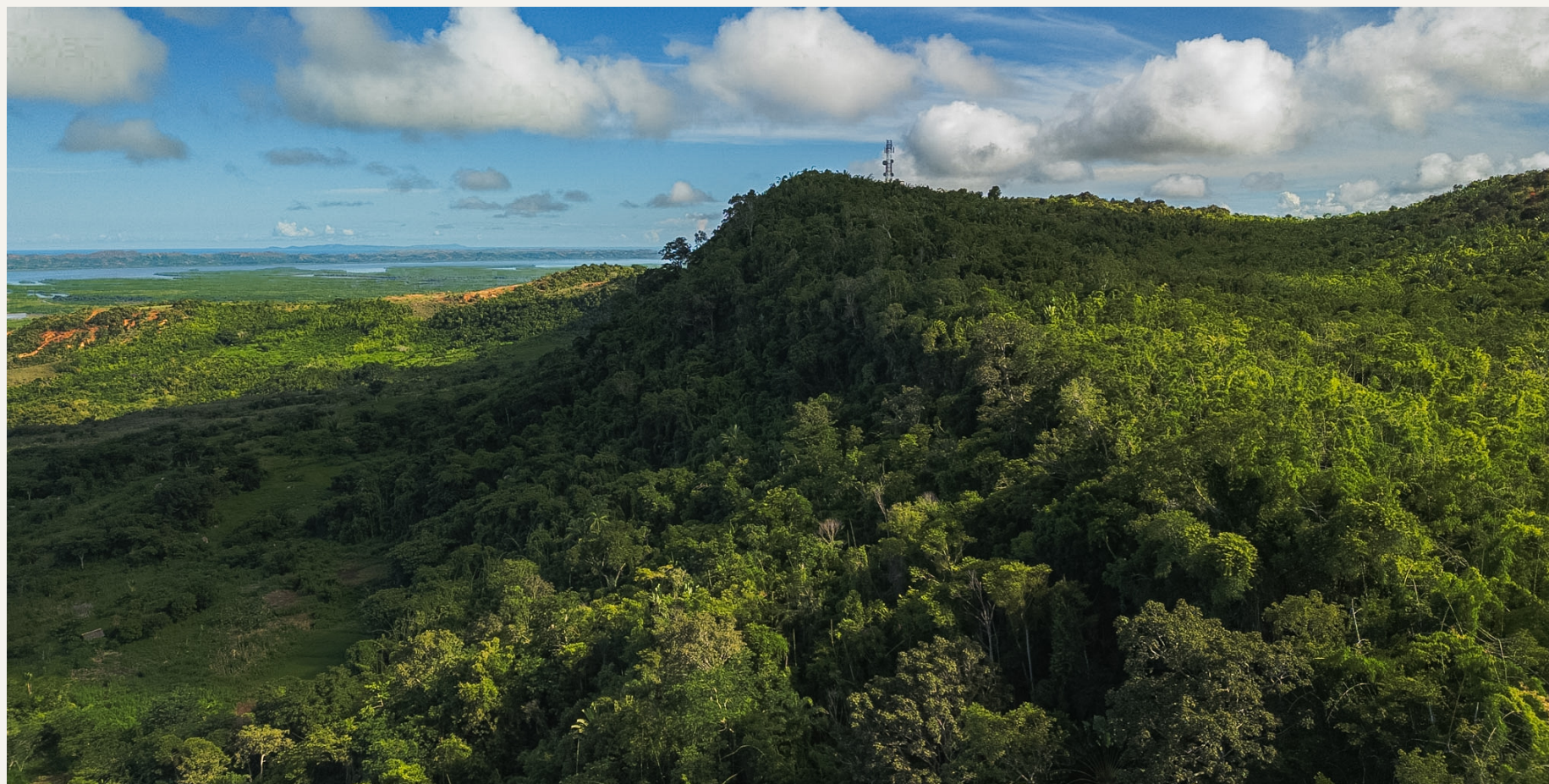
The Andilambologno hill, looking west toward the Mozambique Channel.

An unprotected forest in the last refuge of one of the rarest primates on Earth.