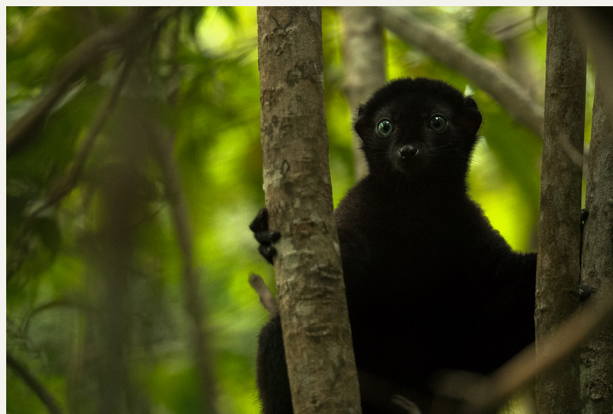
Eulemur flavifrons · Male