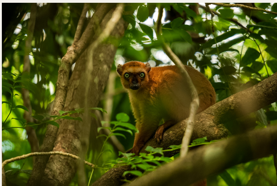
Eulemur flavifrons · Female