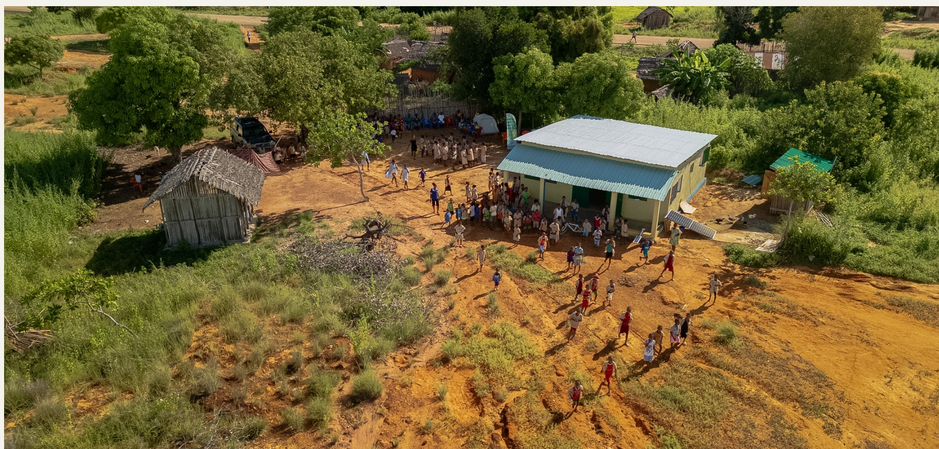
Aerial of the same gathering. The kids saw the drone and chased it.

A talent show in the village. Girls dancing. The kids broke loose into a mosh pit. Above it all, a drone — which the kids promptly chased.