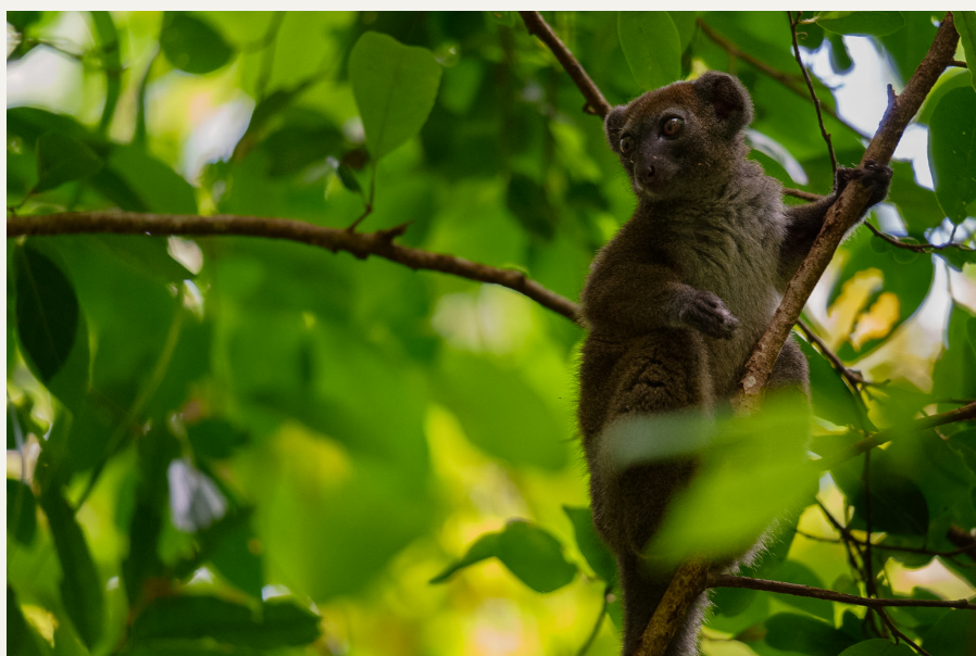
Haplemur occidentalis · Northern bamboo lemur