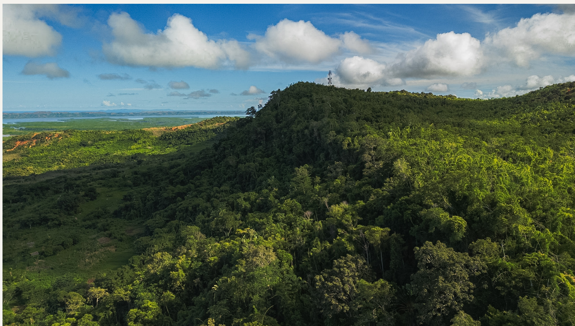
The Andilambologno ridge. The forest extends across both faces. The far side has never been documented.