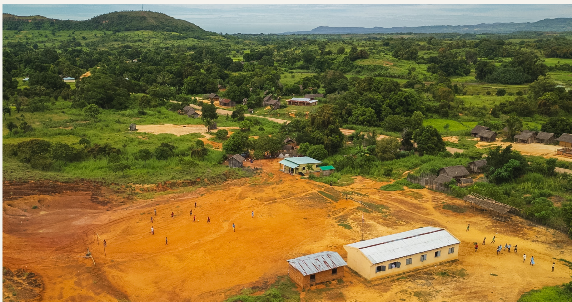
Drone view: existing village school (lower frame) and field research station (middle frame). Kids playing soccer between them. March 2025.

From the ground, you can see the whole project at once. A school at one end. A field research station at the other. Soccer in between. Here it is from above.